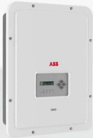
UNO-DM-3.3/4.0/4.6/5.0-TL-PLUS outdoor string inverter